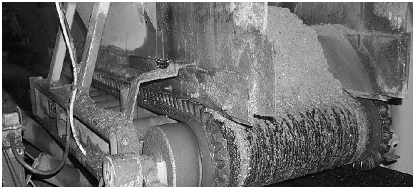
Sea-dredged aggregates working in wet, salty and aggressive environment! IP66/67 sealing – a MUST – often with re-greasable seals!