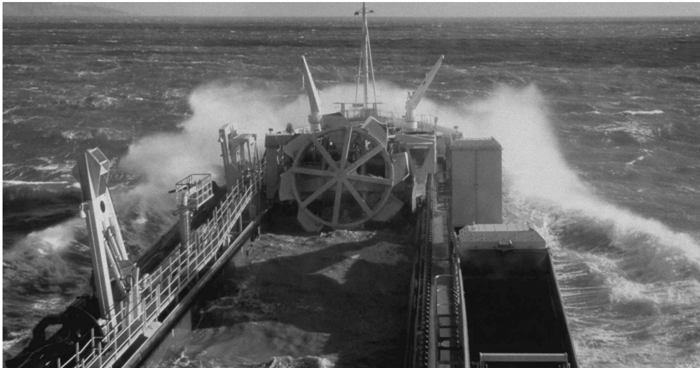
Offshore dredging in the North Sea featuring full capacity unloading at each docking to meet tide turn-round. Capacity: 2700 t/hr at up to 3.15 m/sec.