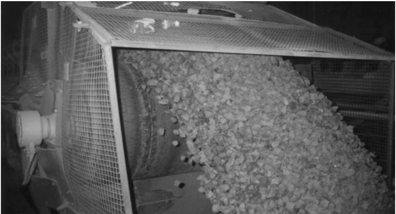
Specification: Twin drive with 2 x 800M, 37.0 kW for this travelling reversible conveyor.