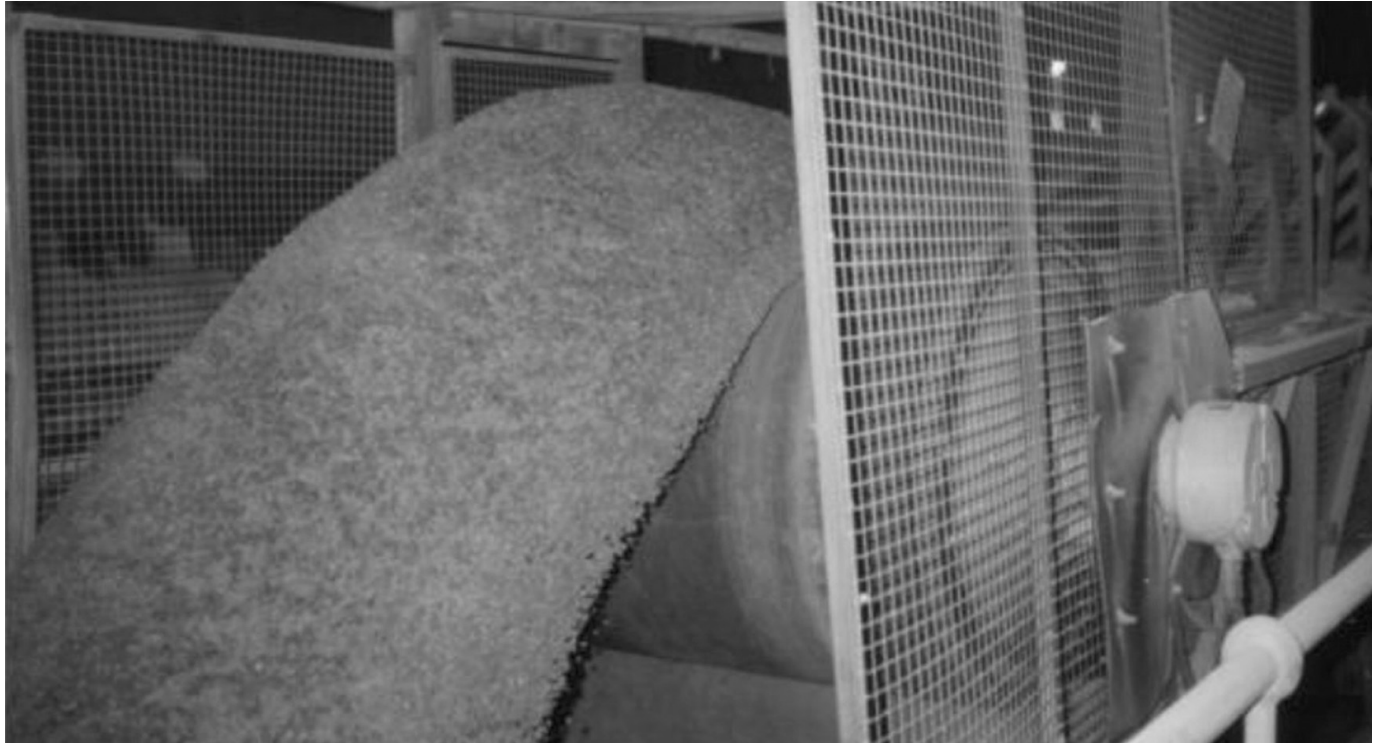
Motorized Pulleys in reversible shuttle conveyor. Application: Crushed granite. 5 Million tonnes per annum pass through this system.