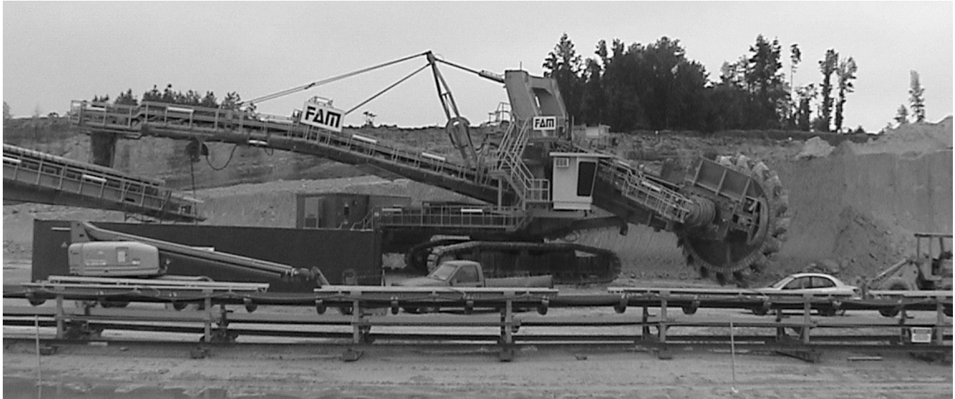
Excavator in a US cement application. Two Motorized Pulleys type 800H drive both the incoming & outgoing conveyors.