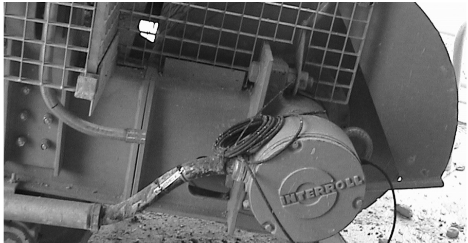
Compact and reliable drive unit using Motorized Pulley type 800H, 75kW at 3.15 m/sec.