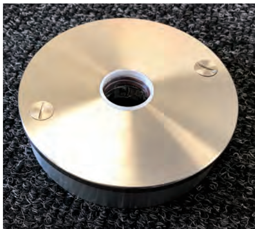
Stainless steel end housing (TS8N) with oil plugs