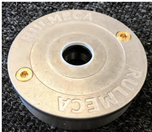
Standard aluminum end housing with oil plugs