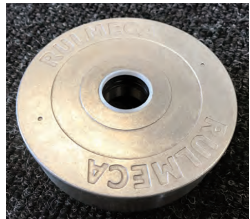
Standard aluminum end housing without oil plugs