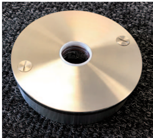
Stainless steel end housing (TS8N) with oil plugs