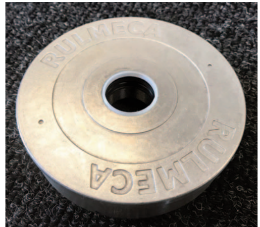
Standard aluminum end housing without oil plugs