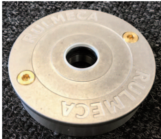
Standard aluminum end housing with oil plugs